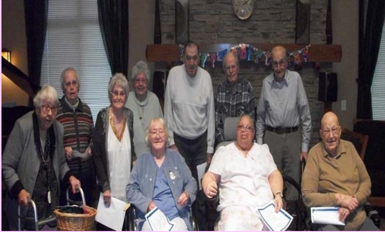
January Birthday Celebrants