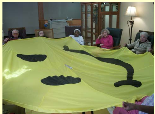
Getting ready for the parachute exercise