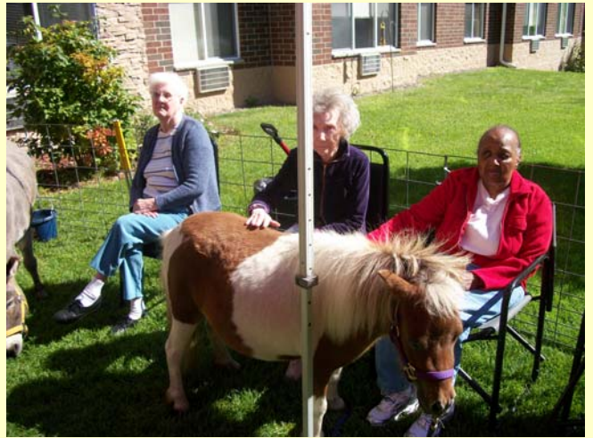
Petting zoo during assisted living week