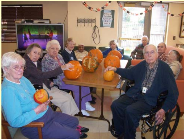
Pumpkin carving for Halloween